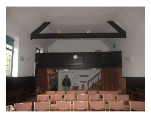
Statement of Significance

Warwick Meeting House has exceptional heritage significance as a fine example of a purpose-built meeting house erected in 1695, to replace an earlier seventeenth century building damaged by fire on the same site. The interior of